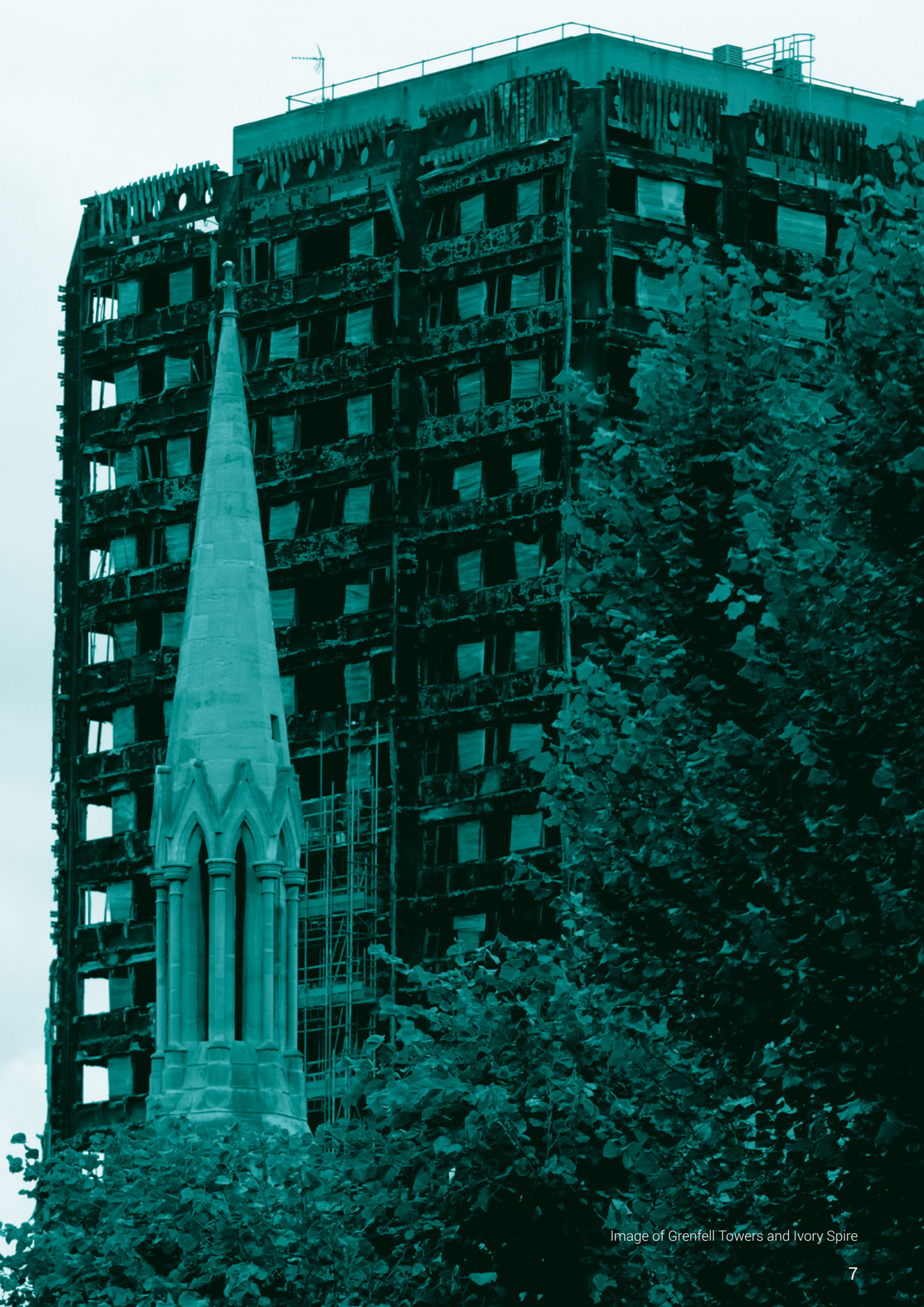
Image of Grenfell Towers and Ivory Spire